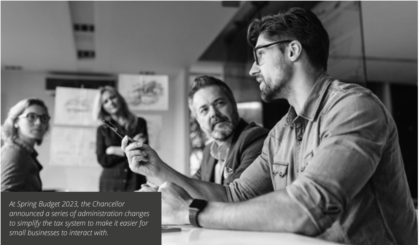
At Spring Budget 2023, the Chancellor announced a series of administration changes to simplify the tax system to make it easier for small businesses to interact with.